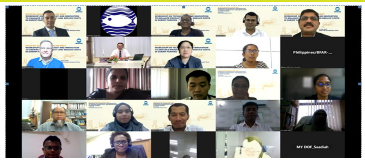
Group Photo of Workshop Panelists and Participants