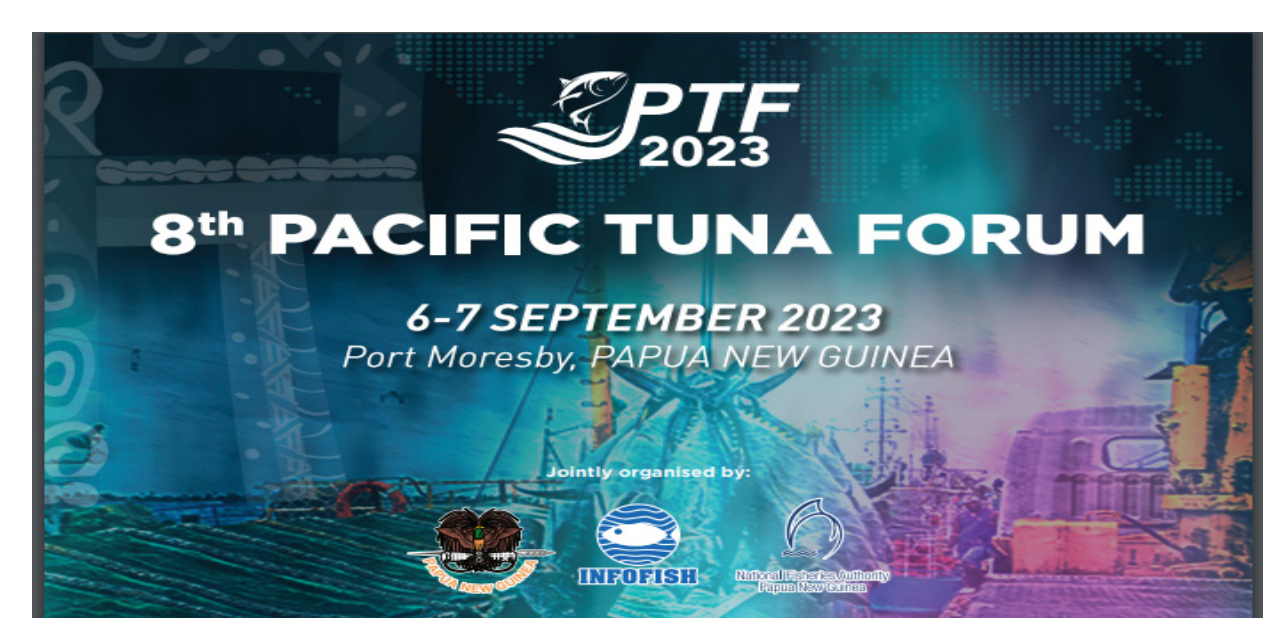
For more information regarding registration, exhibition and program details visit: www.ptf.infofish.org

International. A supplementary section on 'Industry Notes' provides information on the latest developments in the global fisheries scene. New equipments and innovations are also featured. Comments and contributions news and advancements related to recommendations for inclusion in the mailing list.